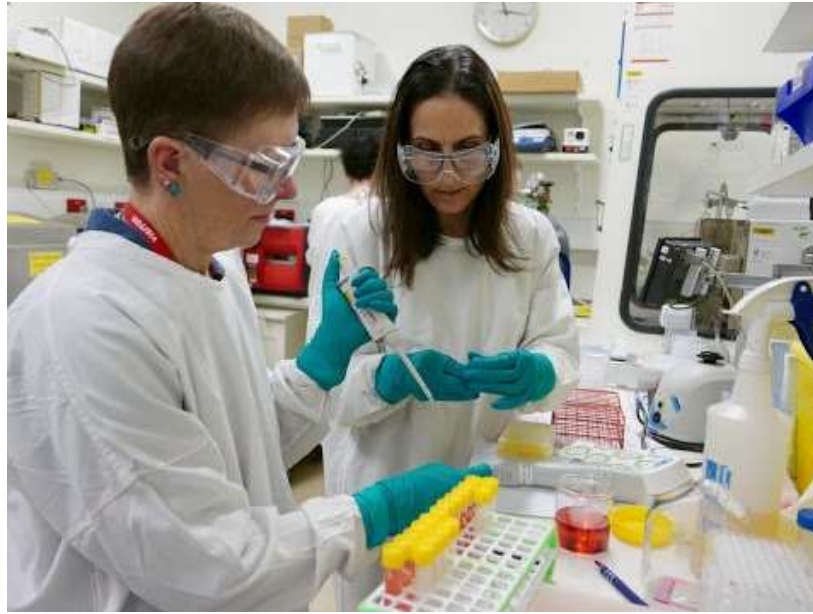
Setting up phase two of the assay; using a range of antibodies to inhibit the virus growth.