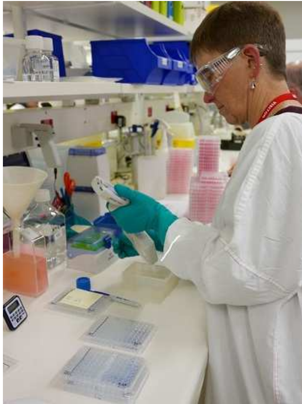
Staining the virus titration plates.