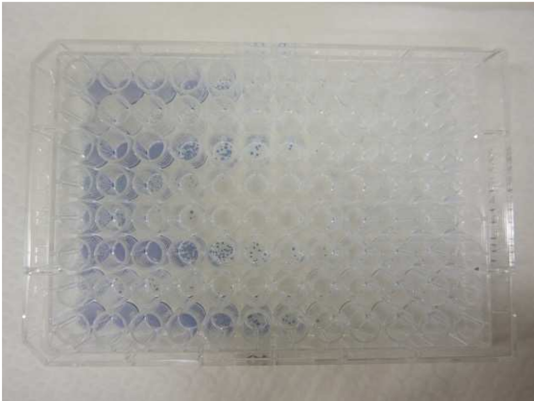
The blue area represents the presence of Influenza A/H3 virus in the cells.