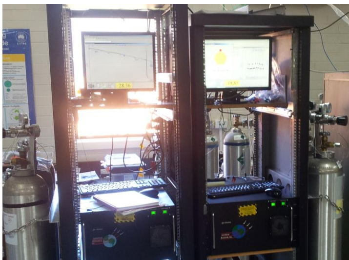
Figure 1: Two Aerodyne QCL instruments at CSIRO in Aspendale. The left system is for measurements of N 2 O and CO mixing ratios, the system on the right is for measurements of CO 2 concentrations and isotope ratios.

I received the QE II Technicians study award in order to receive training at CSIRO in Melbourne, Australia, on state-of-the-art laser instrumentation to measure isotope ratios in atmospheric carbon dioxide (CO 2 ). NIWA is considering the purchase of a similar instrument with the idea of deploying the instrument in remote areas during field campaigns. This study award enabled me to get hands-on experiences on such instrumentation (QCL laser instruments) under the supervision of world-recognized experts in the field. CSIRO is operating two QCL instruments in Melbourne (Fig. 1). Under the supervision of CSIRO scientists, I could follow through the steps of bringing a QCL instrument into service, followed by training on running it independently, e.g. at remote study sites. The first goal was to learn the necessary basics to operate such instrumentation, ranging from basics on operating software to instrument plumbing and performance. The next step was to learn about what it takes to make fully calibrated measurements of highest possible data quality. A further outcome of the visit to CSIRO was that I was able to make some small experiments on the QCL instrument to learn about the variation of the instrument performance. Finally, I had the opportunity to learn about the specialised software that CSIRO uses to manage the resulting large data streams. This training was an extremely valuable learning experience for me and positions NIWA well for future work with such instruments.